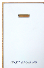
DF Credit Card tag